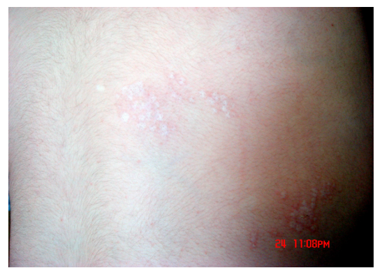
Figure 1. Zosteriform lesions in the right on the back.

Morphea is a localized form of scleroderma characterized by sclerotic plaques. Fibrotic reaction is limited to the skin and visceral involvement is uncommon (2). The 75% of morphea patients are between the ages of 20-50 and 2.6 times more common in women. Our patient was